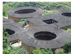
Looking down on a group of Tulou.

elderly still living in the ones we visited, and I can understand why as the pluming consisted of a large earthenware container with a lid on it, that would have to be carried down 4 flights of rickety stairs every morning to be emptied. Gaylene and I stayed one night in a Tulou but Keith preferred the local hotel.