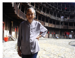
An elderly inhabitant