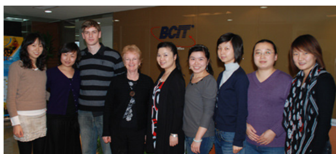
See bottom of next page for names.

Some of you will need a letter of your earnings for taxation or student loan purposes. Please remember to write clearly what you need e.g. salary and/or taxation from ... to ..., and remember that abbreviations may not be understood by us e.g. W-2, FAFSA. We will send you a letter with an official stamp.