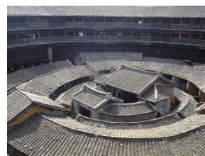
The shrine for the ancestors in the centre.

The Team: (picture on first page from left)